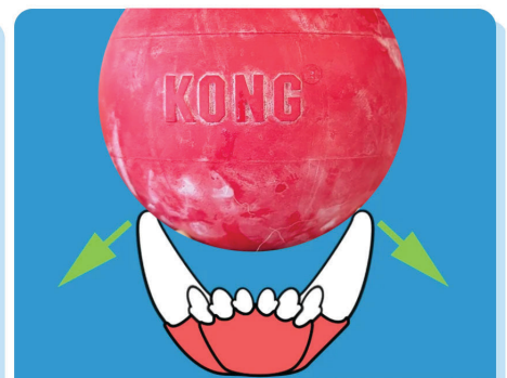
This ball is just right! The forces it applies will push the canines into a good position.